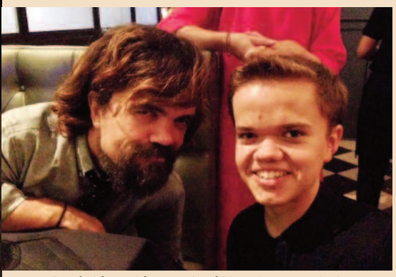
Bambridge with actor (and New Jersey-native) Peter Dinklage.

Growing up in Morris County and, later, Hunterdon County, New Jersey, Bambridge displayed his determination early. Emulating his older