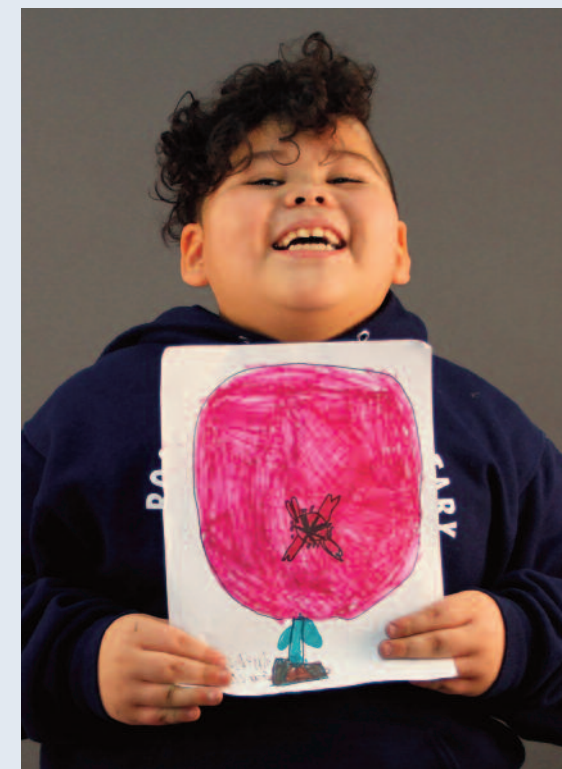
Portrait 1 of 7 from the installation The Sun Will Shine Brighter Tomorrow by student Mahsa Biglow.

Biglow's installation, titled The Sun Will Shine Brighter Tomorrow , was on display at Las Cazuelas Mexican restaurant on French Street in New Brunswick, a city that has welcomed several generations of immigrants from countries including Hungary, Italy, Poland, and Peru. Biglow asked several children of